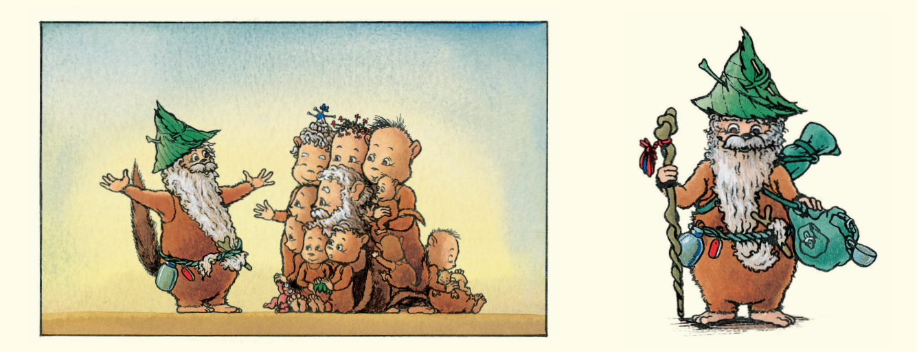
Middling Wind Whispers

Poochie Blue and the Twims have adventures all over their valley. Write or tell a story about one of the spots on your map. What are some special memories you have in this place?